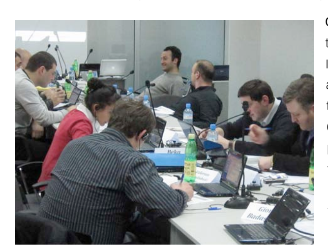
Training Georgia March 2010

The ICAR developed and carried out a total of eight interactive and participant-based asset recovery / financial investigations training programmes in Africa, Asia and Eastern Europe, to audiences representing 17 countries, by a team of experts composed of experienced prosecutors, mutual legal assistance experts and investigators: