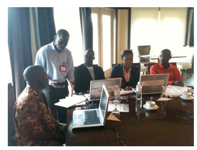
Training Liberia January 2010

Liberia Commissioned by the US State Department, the ICAR carried out a scoping mission to Liberia in January 2010 and based on the findings from the mission developed and carried out two financial investigations training courses in April and in June 2010. The trainees consisted of 18 police officers, prosecutors and staff from the Liberian Anti-Corruption Commission (LACC).